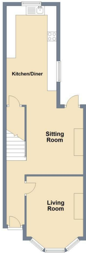
Ground Floor Approx. 44.7 sq. metres (480.8 sq. feet)